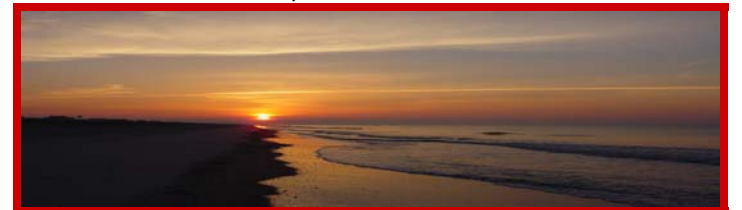
Oak Island's Sunrises and Sunsets Are Priceless