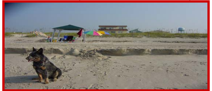
Beach Security Is Very Good!