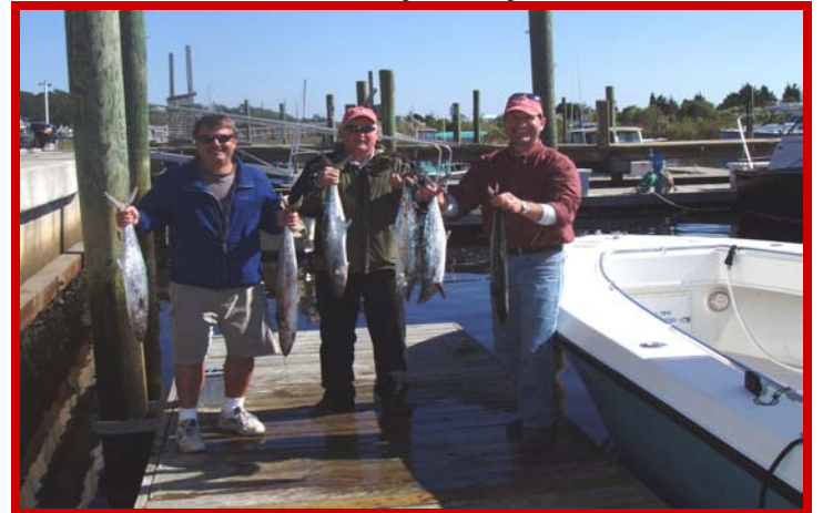
Fishing Can Be Excellent!